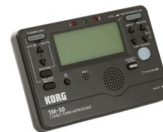
Tuner/Metronome Combo (Recommended model: Korg TM-50)