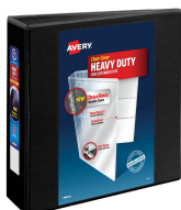
Black 1-inch Binder with Clear View Cover