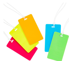
Luggage Tag for Instrument Case